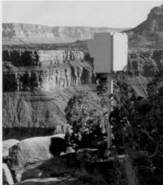
Figure 1. Automatic Camera System in a Remote Location