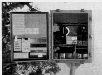
Figure 2. Station Components