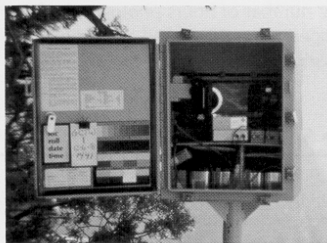
Figure 2. Station Components